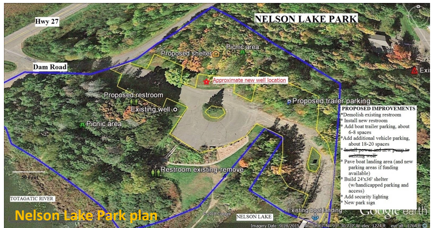
Nelson Lake Park plan