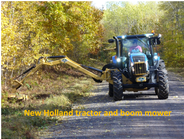
New Holland tractor and boom mower