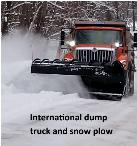
International dump truck and snow plow